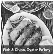
Fish & Chips, Oyster Po'boy