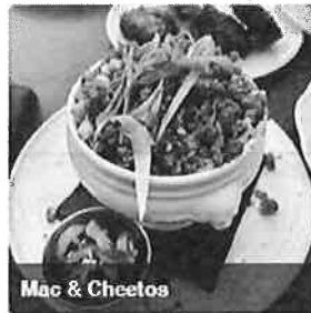
Mac & Cheetos