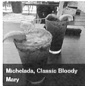
Michelada, Classic Bloody Mary